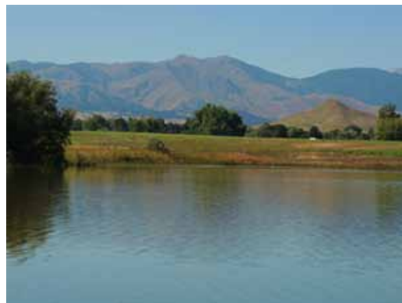
Dodd Reservoir.